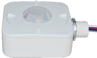
Motion Sensor GTL-BRI819P-B-D