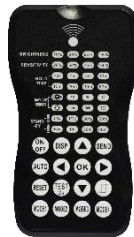
Remote Control GTL-RC100