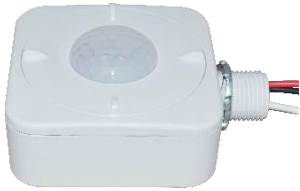
Non-Dim Motion Sensor GTL-BRI819P-B-O