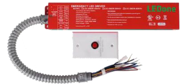
Emergency Driver GTL-EMDR-25WHV