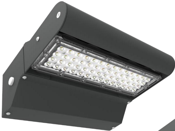
40W or 60W