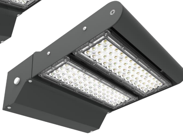
90W or 120W